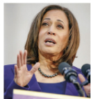
Sen. Kamala Harris

WASHINGTON — Kamala Harris, a first-term senator and former California attorney general known for her rigorous questioning of President Donald Trump's nominees, entered the Democratic presidential race on Monday. Vowing to "bring our voices together," Harris would be the