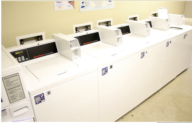
Students were surprised upon their return from winter break to find new washing machines and dryers in the various residence halls. Instead of coins, students can now use their I.D. cards.